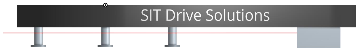
Figure 2 - Installation situation top view, laser field = red

The target to be aligned is set correctly if the same point is hit on all three target marks. The lower edge of the area "0" means that both targets are at exactly the same height if both targets have the same width.